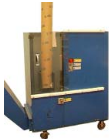
6" & 3" CORE EATER

Cores are placed in the top of the 3" model and on the side of the 6" model, after all white waste, plugs and caps have been removed. After the core has been completed, the machine will stop unless another core has been placed on top of it. Feed rate is between 2' & 8' per minute based on style chosen.